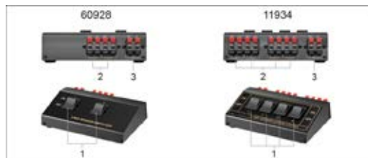
Fig. 2: Operating elements