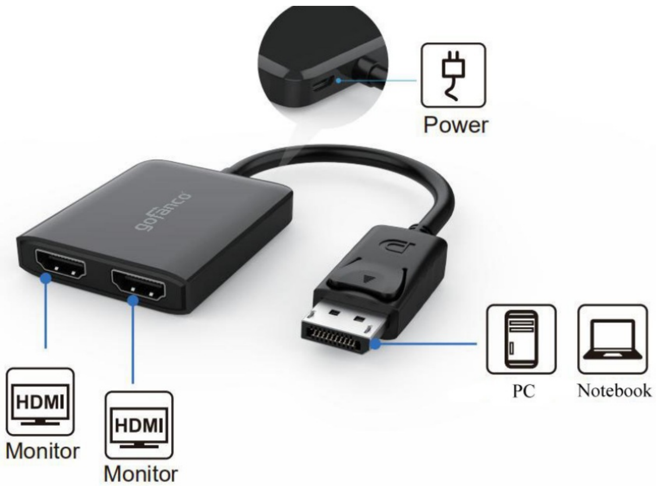
Figure 2: Connection Diagram