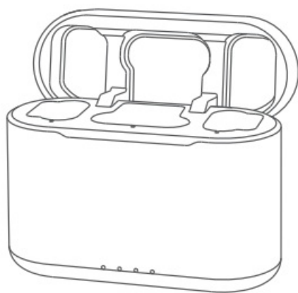
Charging Case × 1