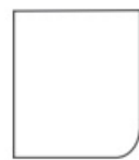
Instruction Manual × 1

Note: Due to continuous updates and upgrades of the products, there may be differences between the actual products and the pictures. Therefore, the pictures are for reference only, products to prevail in kind.