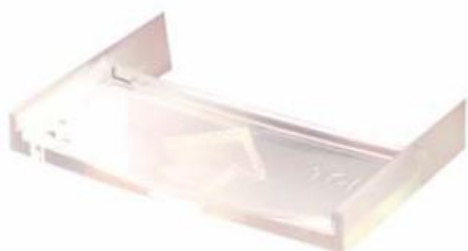
P-PL-CP-32-K Reset key