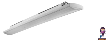
GEWISS GWS3258P Opal Diffuser