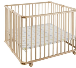
Geuther 2263+Lucilee Plus Cot