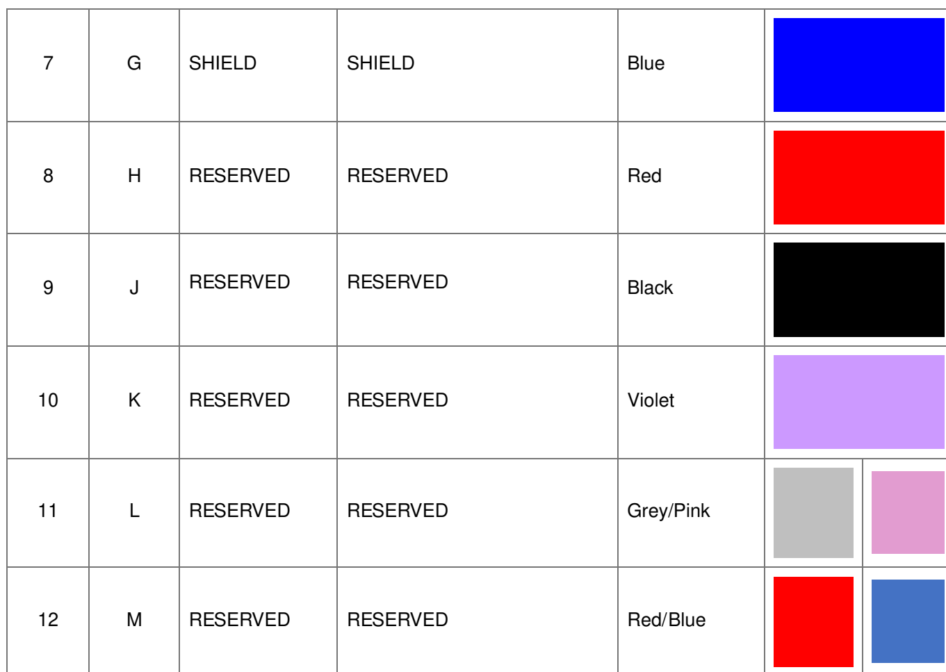
Table 1. VE-3x Connector Pin Assignment and Cable Colour Code