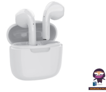
Generic D2 TWS Wireless Bluetooth Earbuds