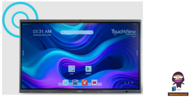
GEN5 Interactive Displays