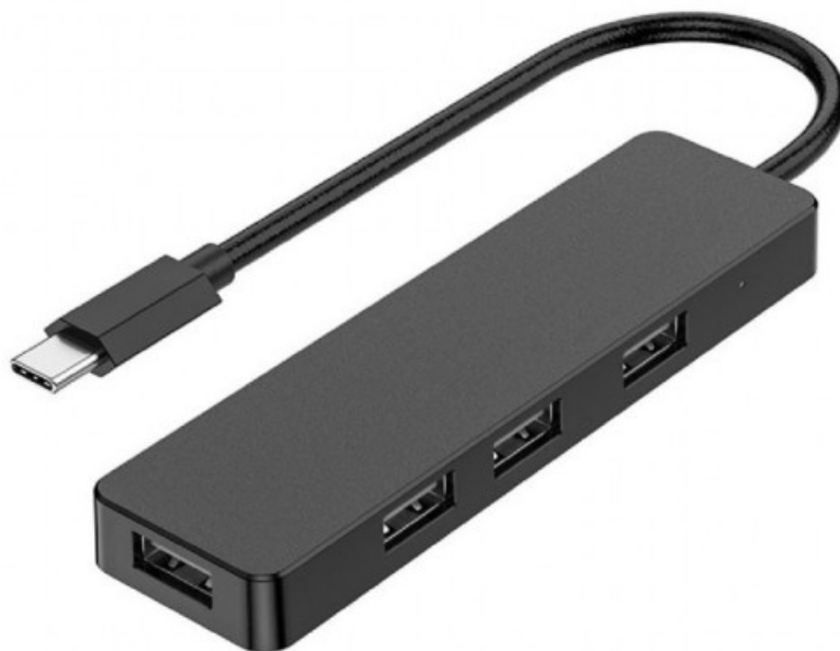
4-Port USB 3.1 (Gen 1) Typ-C-Hub