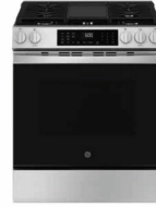
GE APPLIANCES GGS60LAVFS 30 Inch Slide-In Gas Convection Range