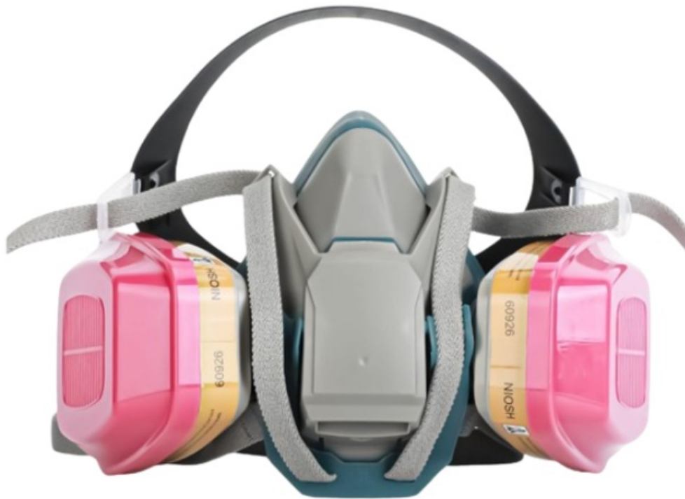
Half Face Respirator