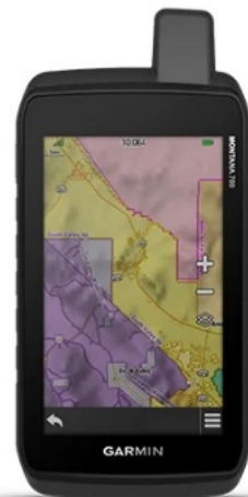
PUBLIC LAND BOUNDARIES