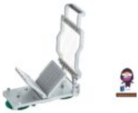
GARDE 181CHEESE38 Cheese Cutter