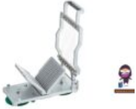
GARDE 181CHEESE38 Cheese Cutter

GARDE 181CHEESE38 Cheese Cutter User Guide