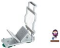
GARDE 181CHEESE38 Cheese Cutter

GARDE 181CHEESE38 Cheese Cutter User Guide