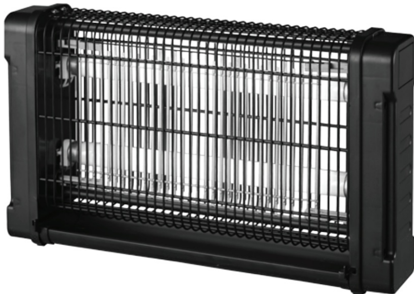
Insect KILLER NG-16 User Manual

Thank you for purchasing our product. Before using this unit, please read this manual.