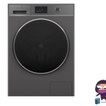
WH1160HG1 Front Loader 11kg Washing Machine