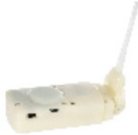
Dancing Fish Mechanism