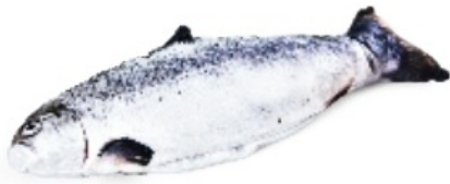
Dancing Fish Plush Shell