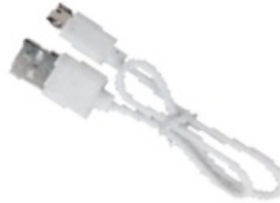
USB Charging Cable