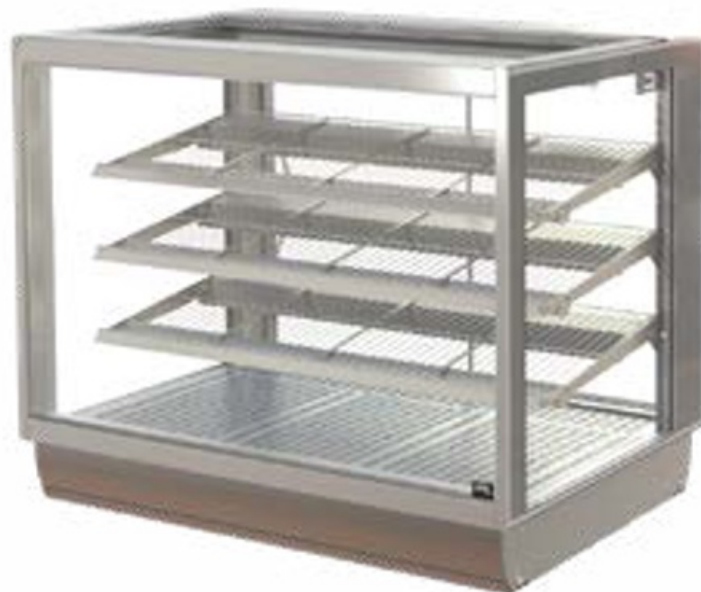
4000 SERIES 1200 IN-COUNTER/SQUARE HEATED

Showing : Inline 4000 Series heated 1200mm square in-counter with fixed front