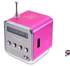
Fosler TD-V26 Bluetooth FM Speaker