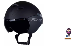
FORCE 2022 Helmet For Cyclists