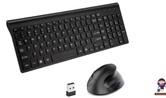
FONICER CKW500BT Vertical Ergonomic Bluetooth Mouse and Keyboard