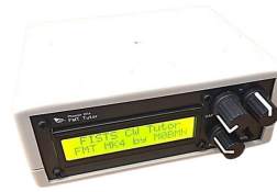
FMT MK4SMD Feature Rich CW Trainer