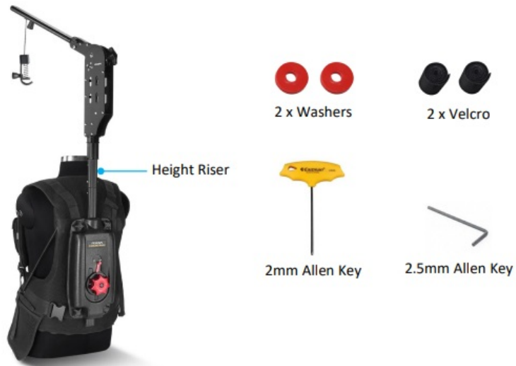
Flowline Edge V1 Stabilization Arm