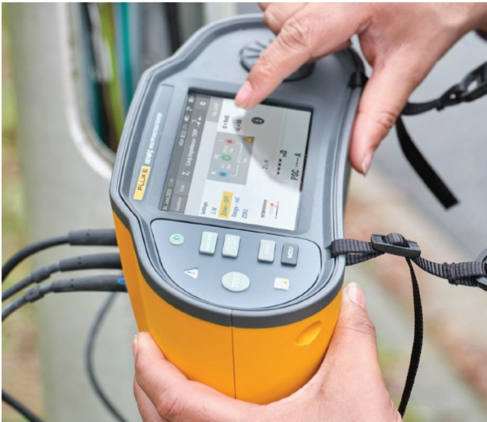
Full-color touch screen and tactile rotary knob for fast navigation