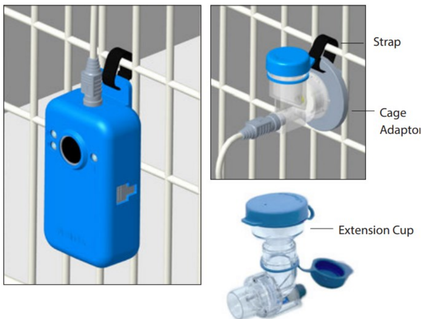
Figure 2: Clinic Cage or Pet Carrier Attachment Use