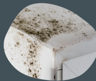
Temperature & humidity sensors for homes

Environmental insights with FireAngel's innovative solutions suitable for all UK homes