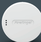
FS2550W2ZB Home Environment Gateway

Enable remote monitoring with environmental insights (temperature and humidity)