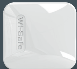
FS1580W2-T Spec Connected Gateway

Enable remote monitoring, real-time status updates and view instant diagnostics reports