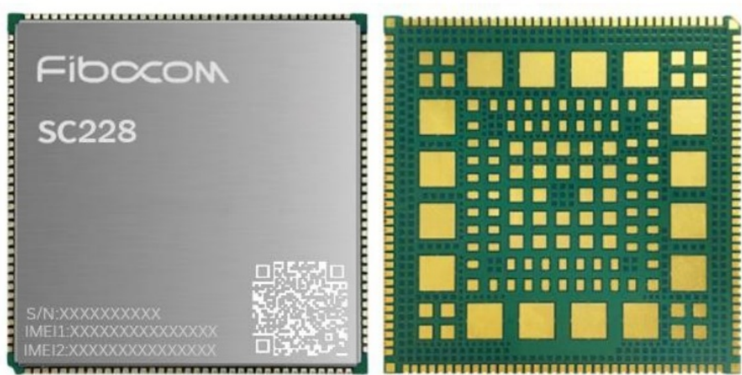
Figure 30. Product appearance