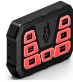
Feniex C-4010 4200 Mini Controller