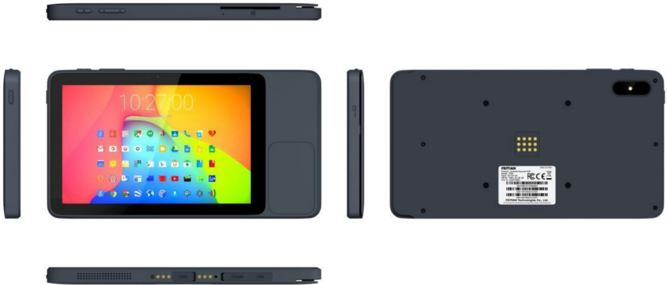
Figure 1 F600 appearance figure