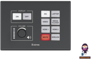
Extron MLC Plus 200 MediaLink Plus Controllers