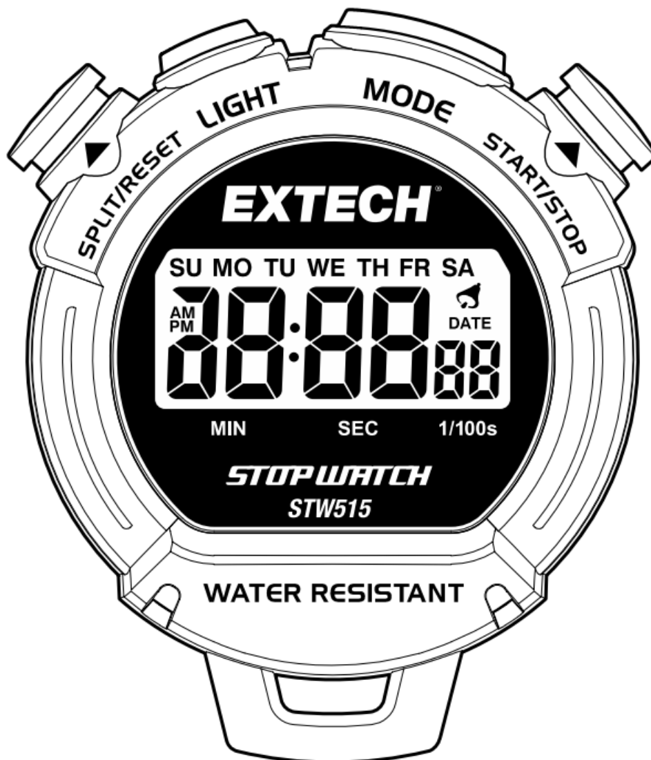
Stopwatch/Clock with Backlit Display Model STW515