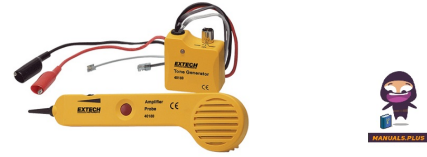
Extech 40180 Tone Generator and Amplifier Probe