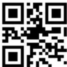
Real-time transmission mode(default)