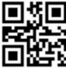
Sleep time setting