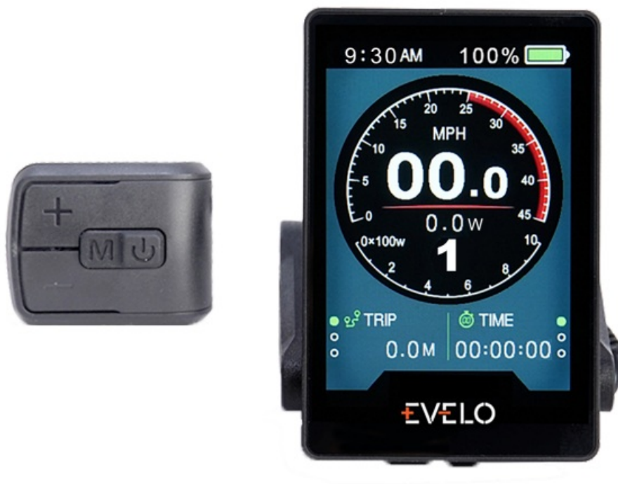
Display and Keypad