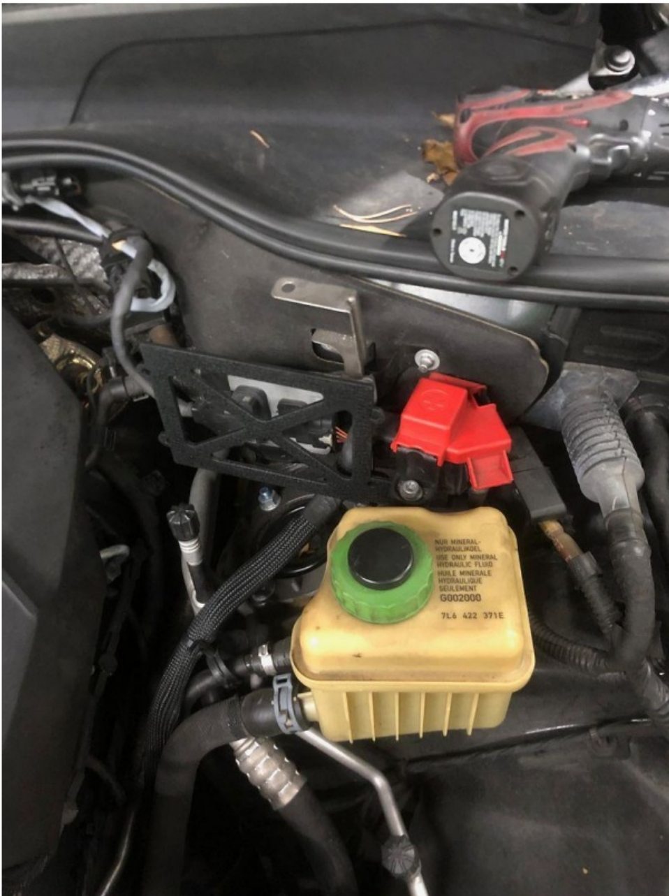
Mount Trigger controller module using supplied M5 bolts