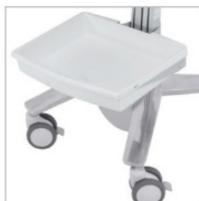
SV FRONT TRAY