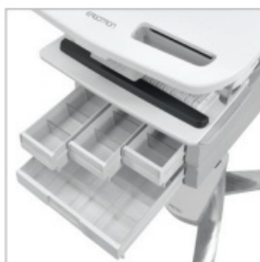
SEVERAL DRAWER CONFIGURATIONS