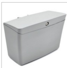
SV STORAGE BIN