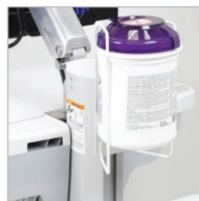
SV SANI-WIPES HOLDER