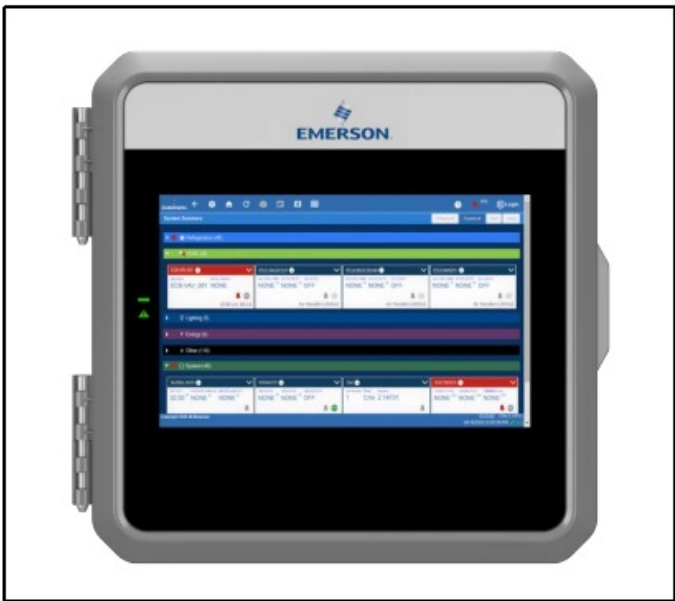
Figure 2 – Site Supervisor Controller