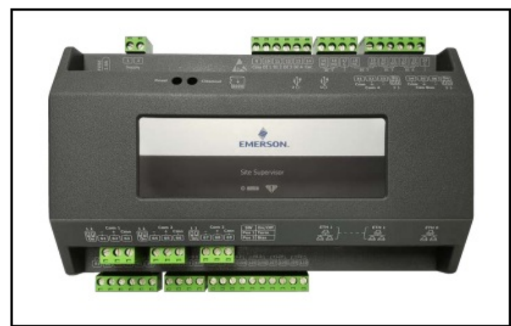
Figure 1 – E3 Controller