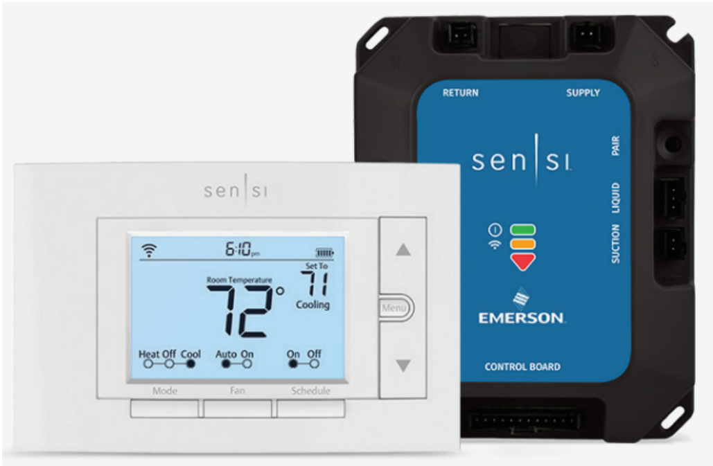
Hub + Sensi™ Smart Thermostat $.....Installed “Classic thermostat”