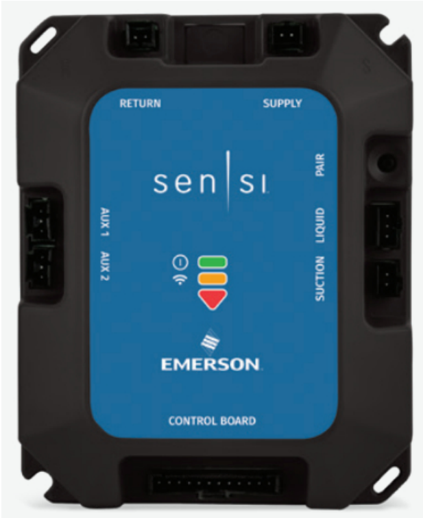
Sensi Predict™ Hub $.....Installed “Smart hub only”