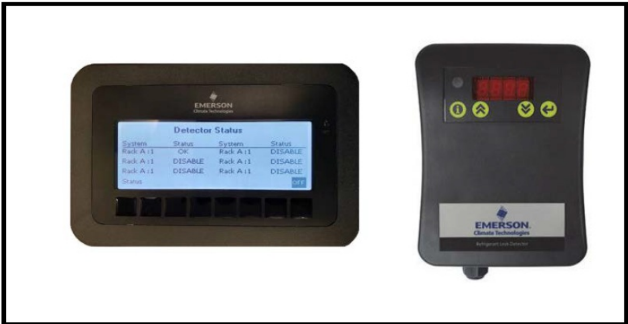
Figure 1 - Multi-Zone Leak Detector and Display