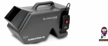
LC-3 Eliminator Bubbletron EX Bubble Machine