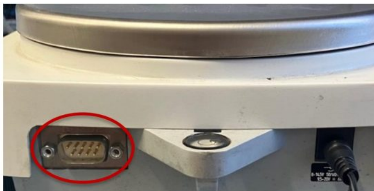
Figure 1 Data port on asset