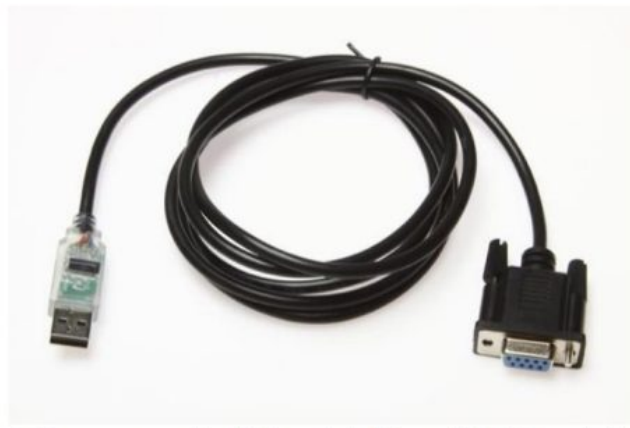
Figure 2 Connector cable USB end (left) and RS232 end (right)