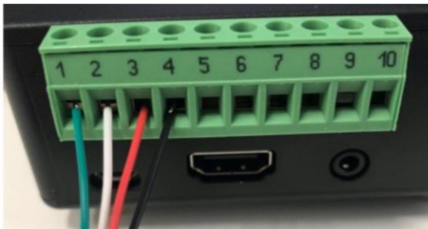
Figure 7 Wiring into the Element-C for flow and pressure measurements