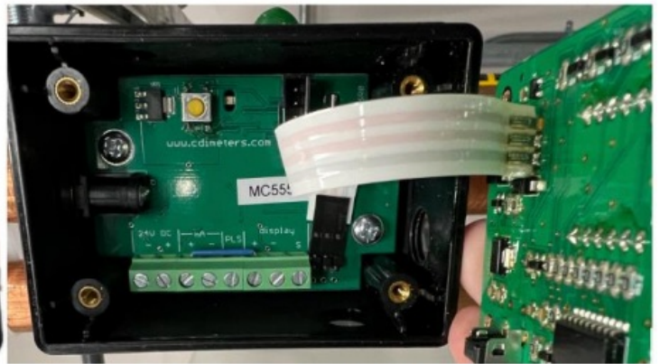
Figure 3a (left): Display board. Figure 3b (right): Output board located underneath the display board