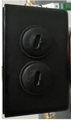
Figure 2 Cable glands on the side of the meter