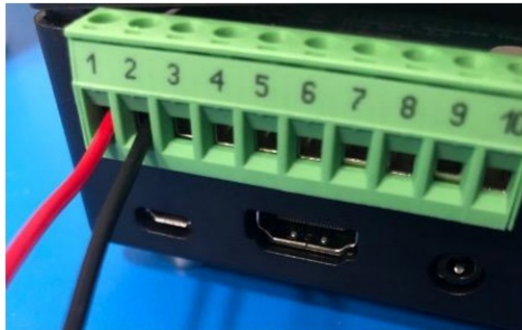
Figure 6 Wiring into the Element-C for flow measurements only