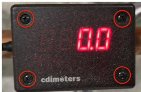
Figure 1 Unscrew the four screws (circled) on the cover of the CDI meter