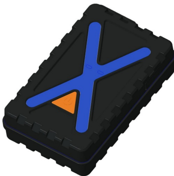
-Top Front-(Towards sky)