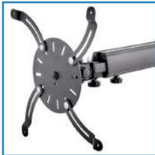
4 mounting holes