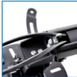
Internal cable management in tube