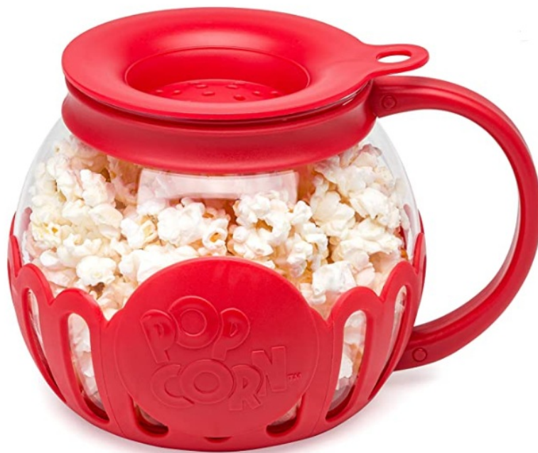
evolution Micro-Pop Popcorn Popper

Temperature safe glass Dishwasher safe Lid measures kernels and melts butter