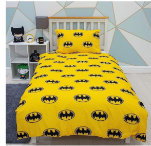
eBay Bedding Set