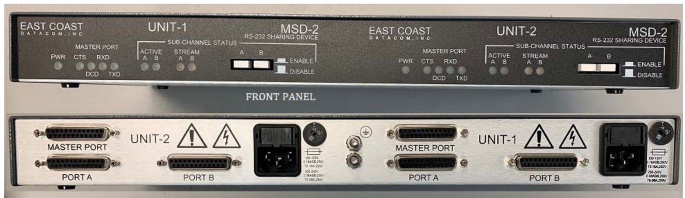
FRONT & REAR VIEWS, PT# 280000, MSD-2