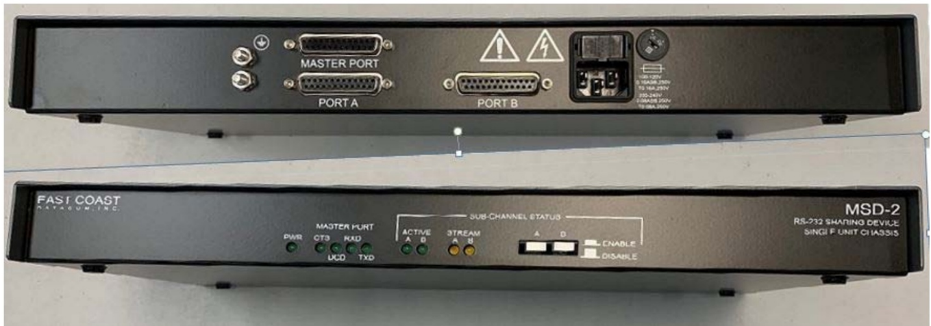
REAR & FRONT VIEWS, PT# 274000, MSD-2