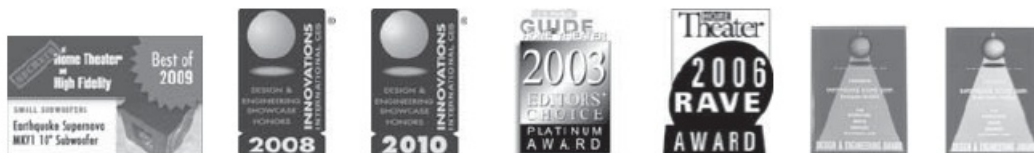
MiniMe DSP 8 Manual 3