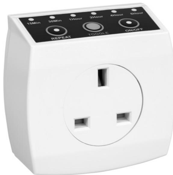
E304CM Count Down Timer