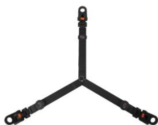
GS02 Ground spreader