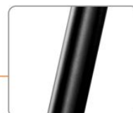
High quality aluminum tube.