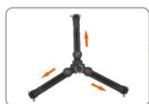
Adjustable middle spreader adding extra stability.