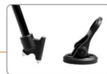
Spike foot & big rubber are both available.