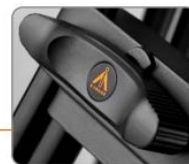
Ergonomic hand locking knob.