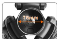
75mm bowl size.

The E-IMAGE GA752 two stages aluminum tripod supports a payload weighing up to 88lbs. It is made of lightweight aluminum has a 75mm bowl and the legs are a twin tube design with two stages. The Mono-Lock feature allows for quick height adjustments of both stages with one twist. An adjustable mid-level spreader provides extra security and stability.